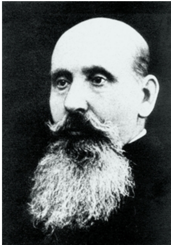
Figure 1: Rev. Heinrich Pesch, S.J.; By Unknown author - Unitas Ruhrania ; Public Domain, Wikimedia Commons